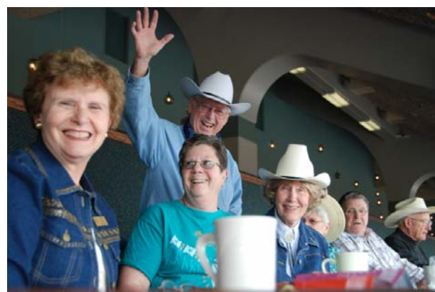
More big smiles....am I the only one who lost ???