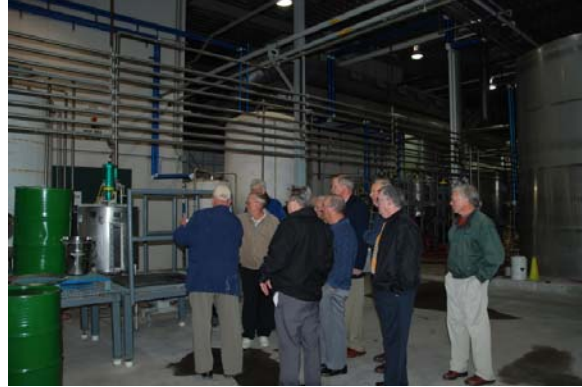
Gyros learning how to brew beer !!

Twenty members attended the May 21 meeting at the Big Rock Brewery. After a roast beef luncheon and a little business, interested members took a tour of the brewery. Our guide took us through the beer making process, from malt barley to the final product. Following the tour, there was a highly recommended (though not mandatory) tasting of the many beers produced by the brewery. A good time was had by all.