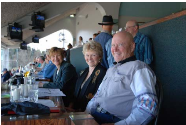
Those big smiles must mean they won !!