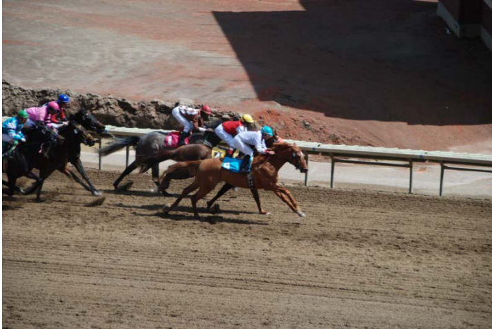
My horse didn't even make it in the picture !!

On Saturday May 10 th , 40 Gyros and Gyrettes together with one guest enjoyed a wonderful day at Stampede Park. There were eight thoroughbred races run, and from the sounds of agony and delight, there were a lot of winners and losers !! Some more than others.