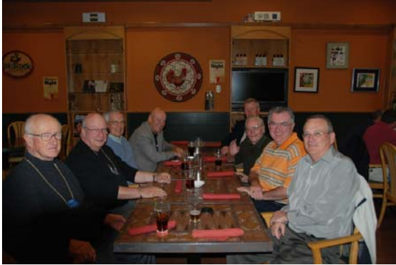
The real beer drinkers !!