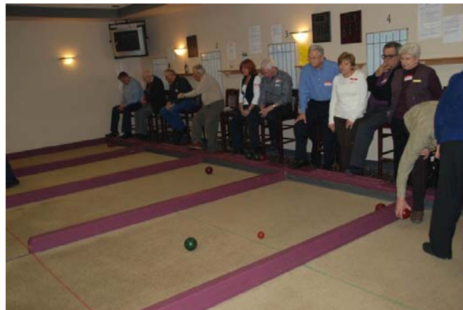
Everyone looks pretty serious – and its Fun Night !!