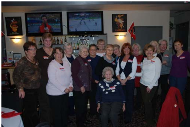
A wonderful group of ladies at Fun Night.